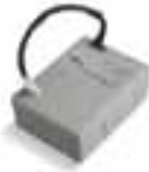
PS124 24 V battery with integrated battery charger. Pc/pack 1