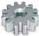
RUA12 12-teeth pinion, module 6, to be coupled with rack ROA81. The Run automation is supplied with a module 4 pinion to be used with the standard racks ROA7 and ROA8. Pc/pack 1